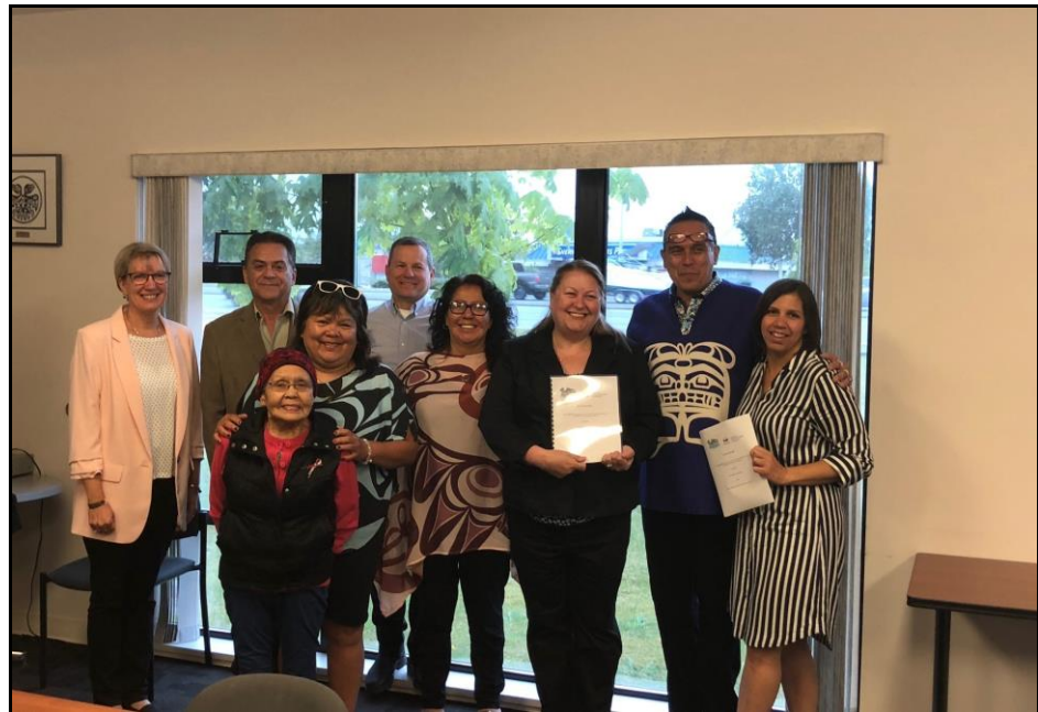
June 1st 2018 - Mamalilikulla FN with MCFD - Service Agreement Signing in Campbell River