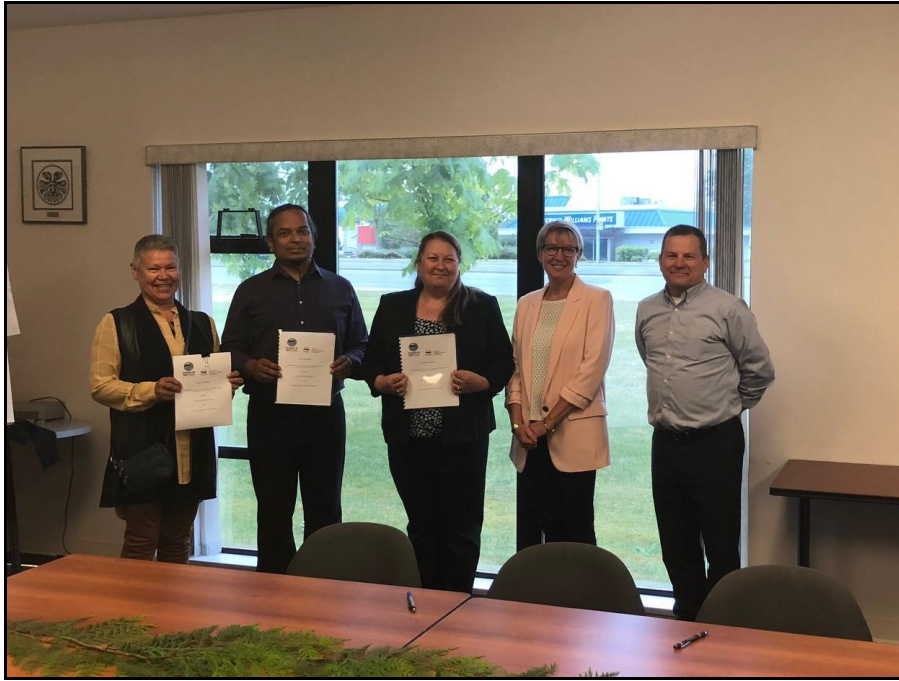
June 1st 2018 - Da'naxdaxw Awa'etlala FN with MCFD - Service Agreement Signing in Campbell River

In June of this year Sasamans Society was honoured to witness the signing of a Service Agreement between Mamalilikulla First Nation and MCFD and Da'naxda'xw Awa'etlala First Nation and MCFD. This was a momentous occasion and it is our hope to be able to see this work continue with other bands and MCFD. Building these positive working relationships is essential for building better child welfare services for Indigenous children, families and communities.